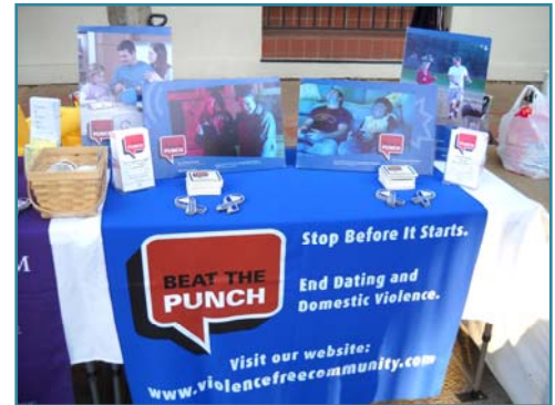
Outreach table at the Farmer's Market, a popular destination for Cal Poly students

"We've accomplished a lot. We've included the Women's Shelter Program and now we have IPV protocol in our handbook and on our website. They train our housing staff and we've incorporated IPV prevention into [our sexual assault prevention] work."